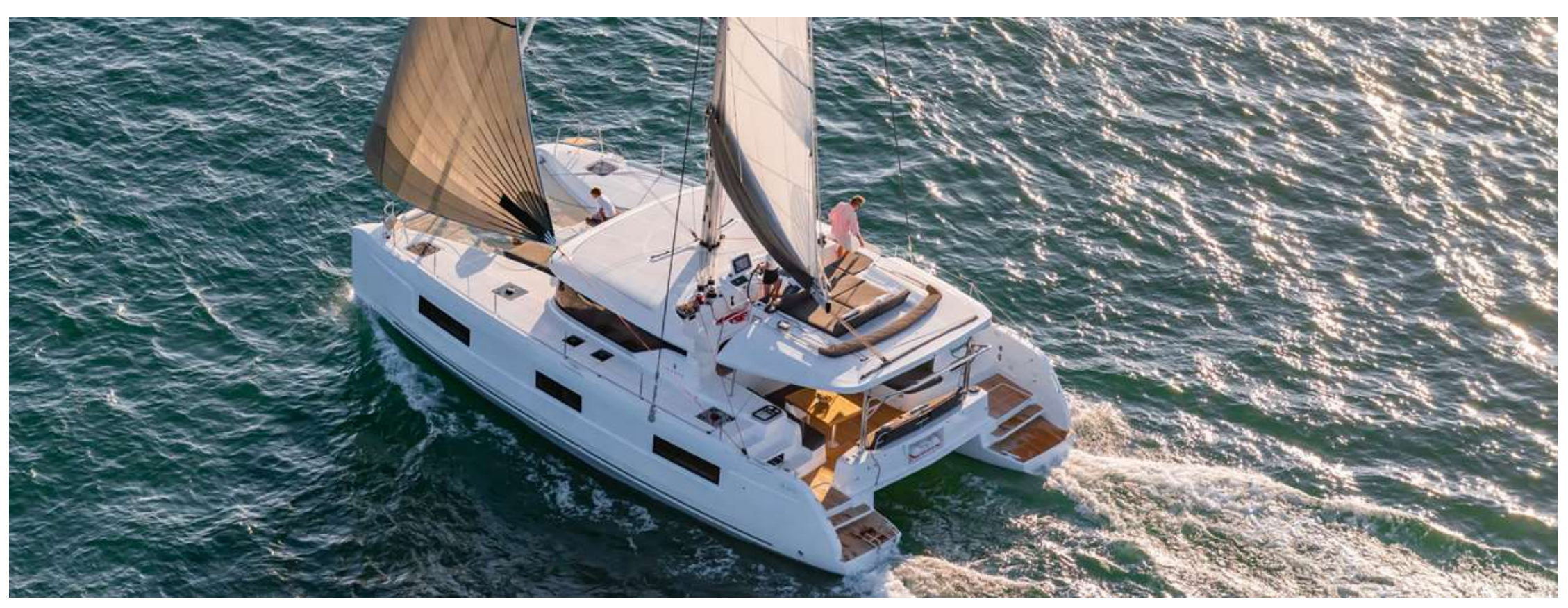
Let your dreams set sail